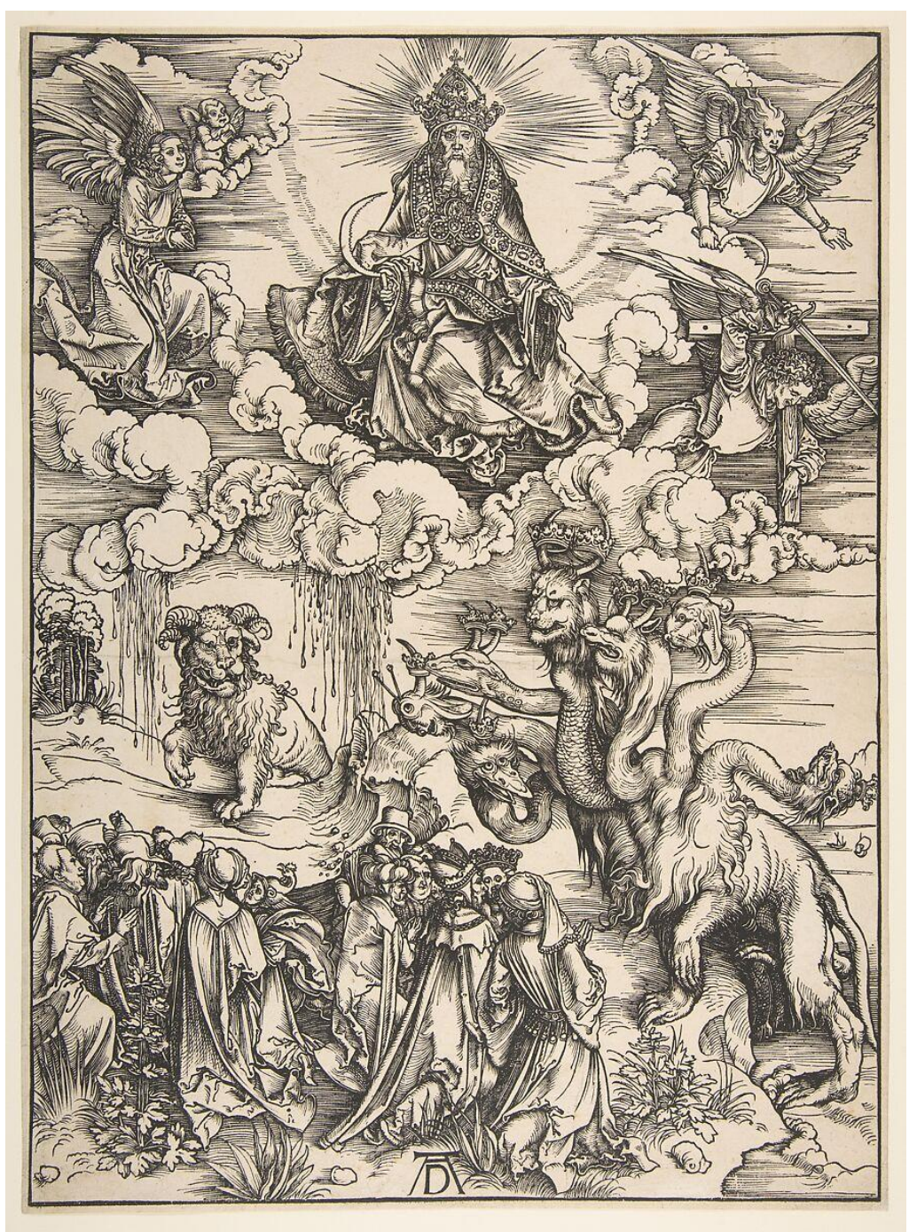
7 Headed Beast Mentioned in the Book of Revelation Chapter 13